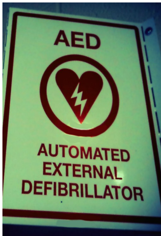
There are several AED machines around Scarlet. A sign like the one above is at each location .