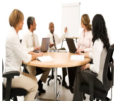
Co-workers practicing good communication !

Developing and practicing good communication skills will help you to be successful in getting and keeping a job!