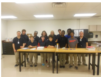
Career X from Diamond (above) and Scarlet (below)